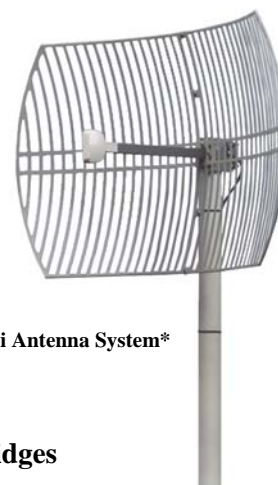
24dBi Antenna System*